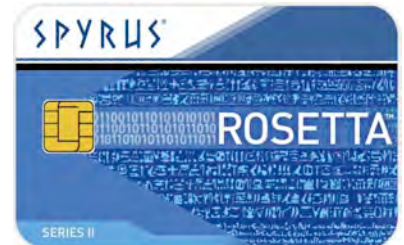
Rosetta Smart Card